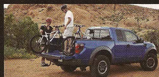
Ford F150 Raptor