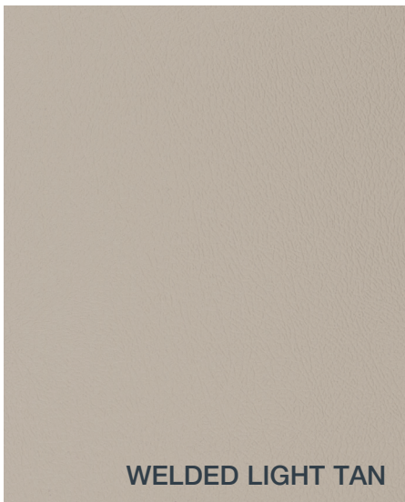
WELDED LIGHT TAN