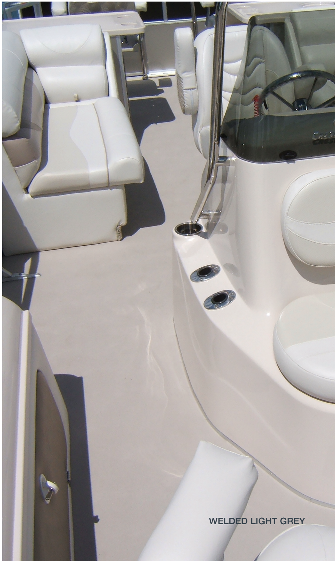
WELDED LIGHT GREY