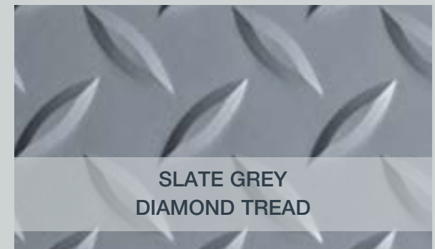
SLATE GREY DIAMOND TREAD