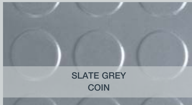
SLATE GREY COIN