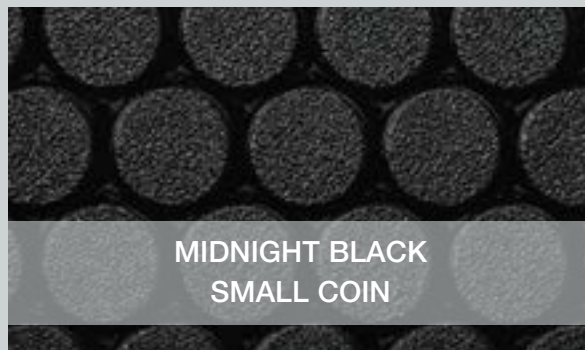
MIDNIGHT BLACK SMALL COIN

*All products come with 440 spun bound backing