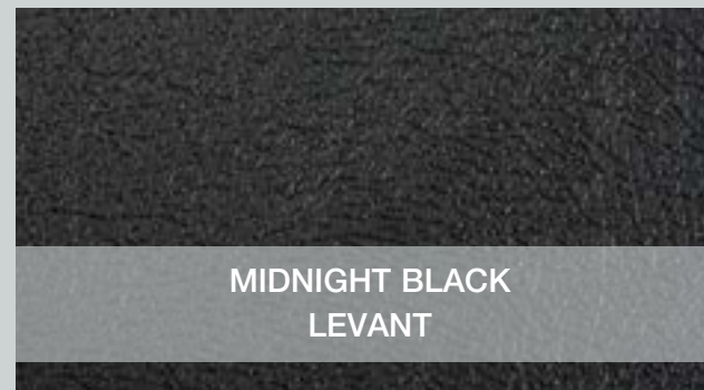
MIDNIGHT BLACK LEVANT